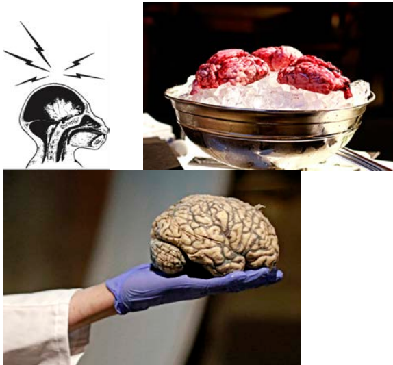
Fig 1. VOID BRAINS , 2016, Voidbook Cover sujet, iced brains/ neuroscientific concoction of human brain, presented at the DADA soirée at Cabarét Voltaire Zurich, Foto: imonym

The Void book circulates idealiter in the Cabaret Voltaire Zürich as the historical site of the birth of DADA. The Ludic Society, who acts as “editor” of the book on the impossibility of emptiness and the conditions of void space als public play ground. The Ludic Society defined itself in its first manifesto, published in the European Game Studies magazine Eludamos (Real Player Manifesto, In: Eludamos. Journal for Computer Game Culture, Vol 1, No 1, 2007; online available on http://www.eludamos.org/index.php/eludamos/article/viewArticle/vol1no1-5/10 ) as loose group of affiliates applied a variety of individual game mechanics in order to develop methods of public play, presentation and creation. The vacuum pump of experimental research on absence can be best activated there in the collective absinthe ecstasy, at any moment or at the occasion of the Void book presentation as present for the 100th anniversary of Dada in 2016. Such a public event marks the launch of a real-time space patrol, as the writer Stanislaw Lem (1971) would describe a toxicologically induced flight in the emptiness of the mental A VOID space, brain-drain controlled, experienced as VOID level in the brain of the player.