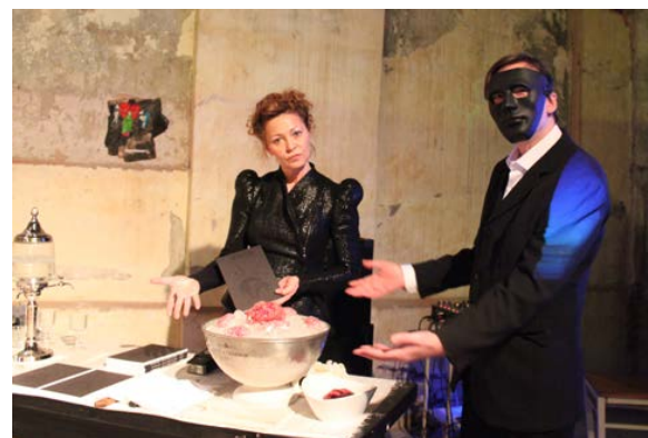
Fig 1. VOID VIENNE soirée , 2016, Auditorium Goldscheyder, Brain, absinthe fontaine and VOID book, with permission of Ludic Society.

The Void function conceptually releases the socially irrelevant focus on game rules into the most relevant rules of play like a space ship would slip into data space. Break Absinth bottles! A VOID!