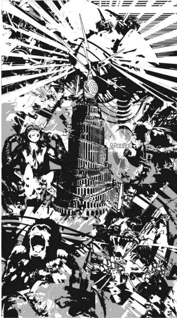
Fig 3. ENTER THE VOID , 2016, Lecture Poster, graphic design Max Moswitzer, with permission of Ludic Society.