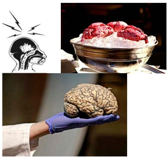
Fig 1. VOID BRAINS , 2016, Voidbook Cover sujet, iced brains/ neuroscientific concoction of human brain, presented at the DADA soirée at Cabarét Voltaire Zurich, Foto: imonym

The Void book circulates idealiter in the Cabaret Voltaire Zürich as the historical site of the birth of DADA. The Ludic Society, who acts as "editor" of the book on the impossibility of emptiness and the conditions of void space als public play ground. The Ludic Society defined itself in its first manifesto, published in the European Game Studies magazine Eludamos (Real Player Manifesto, In: Eludamos. Journal for Computer Game Culture, Vol 1, No 1, 2007; online available on http://www.eludamos.org/index.php/eludamos/article/viewArti cle/vol1no1-5/10) as loose group of affiliates applied a variety of individual game mechanics in order to develop methods of public play, presentation and creation. The vacuum pump of experimental research on absence can be best activated there in the collective absinthe ecstasy, at any moment or at the occasion of the Void book presentation as present for the 100th anniversary of Dada in 2016. Such a public event marks the launch of a real-time space patrol, as the writer Stanislaw Lem (1971) would describe a toxicologically induced flight in the emptiness of the mental A VOID space, brain-drain controlled, experienced as VOID level in the brain of the player.