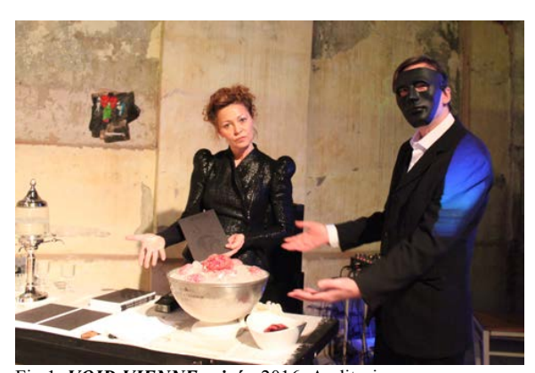
Fig 1. VOID VIENNE soirée , 2016, Auditorium Goldscheyder, Brain, absinthe fontaine and VOID book, with permission of Ludic Society.

The Void function conceptually releases the socially irrelevant focus on game rules into the most relevant rules of play like a space ship would slip into data space. Break Absinth bottles! A VOID!