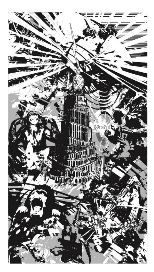
Fig 3. ENTER THE VOID , 2016, Lecture Poster, graphic design Max Moswitzer, with permission of Ludic Society.